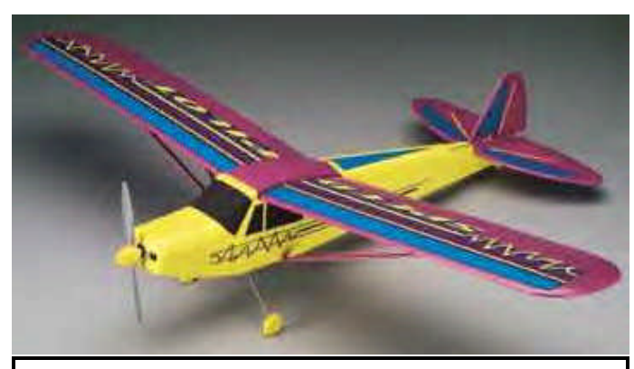
Speed Pilot from Hobbico Photo

Visit the Hobbico world wide web site at: www.hobbico.com