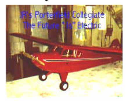
The March EFO Meeting

P.S. I just finished my Porterfield Collegiate and look forward to flying it as soon as we get some decent weather. I 'm attaching a scan of it.