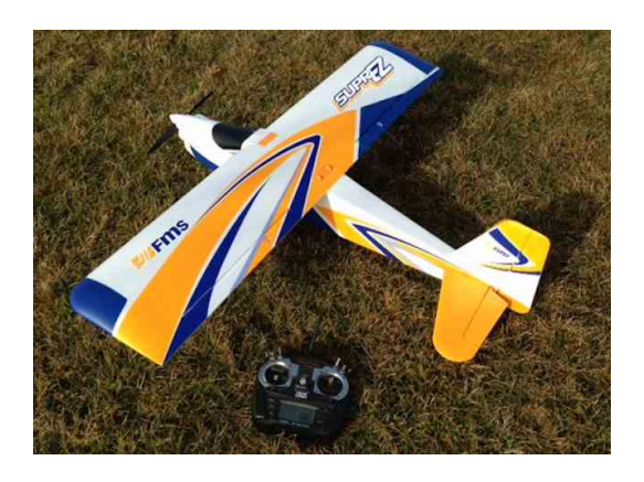
By Ken Myers, February 2016

http://www.theampeer.org/ampeer/ampmar16/1220mm-Super-EZ-manual.pdf