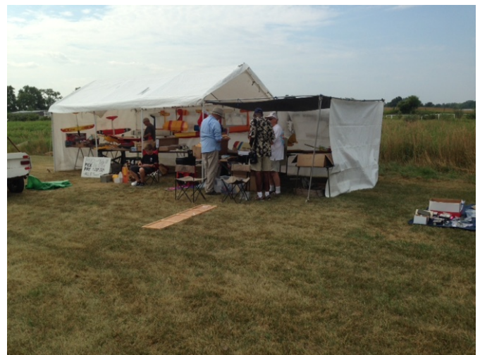
Parking, Concessions and the Price-less Sale