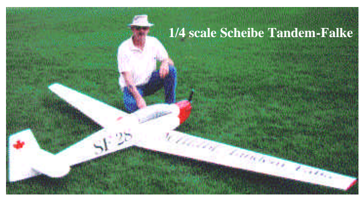
Henschel Hs132 Article

over 15 pounds as an unpowered sailplane (I have built two noses for it). It has completed almost 50 flights presently, with about 10 as a motorized sailplane and the remainder launched from a winch. I am quite pleased with the whole project.