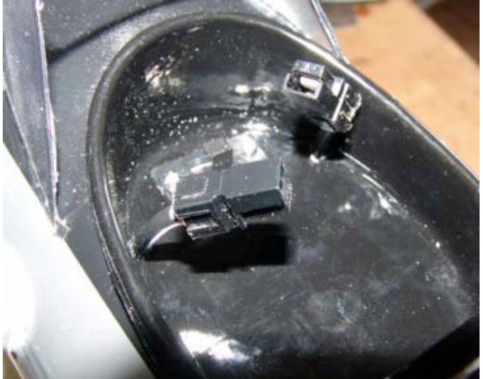
I have a switch in my Ryan STA that is very similar in concept to the one that I showed last month

I outlined MY procedure last month, and restate it again here. When I am ready to fly, I turn on my transmitter, then the receiver and then connect the power battery. I button up the plane and go fly. After landing, I disconnect the power battery, shut off the receiver battery and then the transmitter. I remove the Li-Po battery from the airframe.