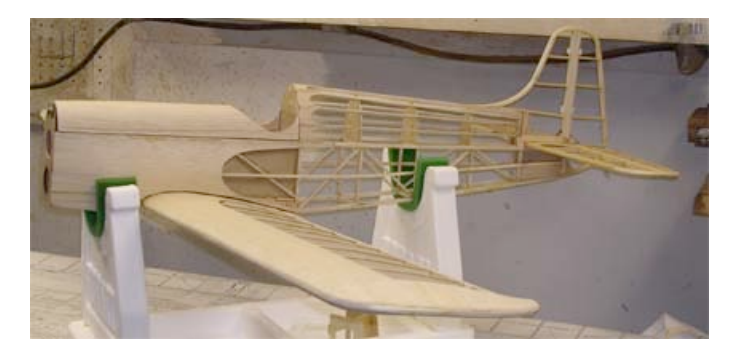
CWL Questions From Bill Mackey

http://www.rcmodel.com/tiger/tigerk.html Here is another photo of Nick's under construction to pique your appetite.