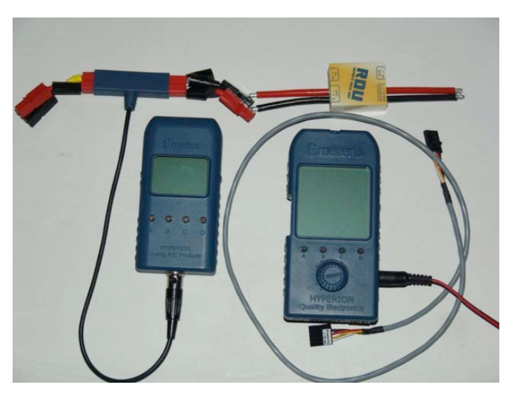
It is FINALLY here!