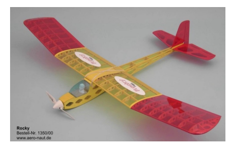
Aero-naut Rocky Electric Glider https://alofthobbies.com/aero-nautrocky-electric-glider.html