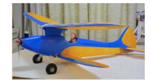
Retro RC Chicken Hawk MA, Feb. '21, p. 43 Data presented in this article