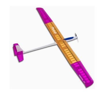
TopModel Prelude 2.5 Meter https://alofthobbies.com/topmodelprelude-2-5-meter.html