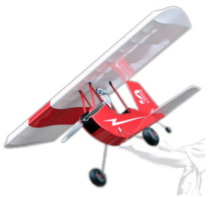
StevensAero FREDe 2X ToonScale Slow Flyer https://www.stevensaero.com/product/ frede-2x-toonscale-slow-flyer/