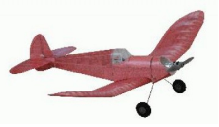
BMJR Panther https://www.bmjrmodels.com/panther