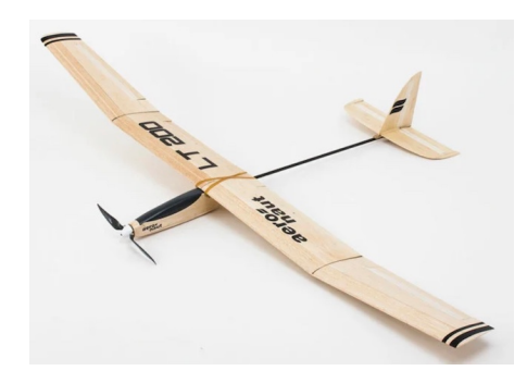
Aero-naut LT 200 Flex https://alofthobbies.com/aero-nautlt-200-flex.html