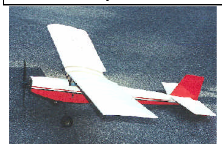
Two Old Timers

From: Armand Francoeur afran@mediaone.net