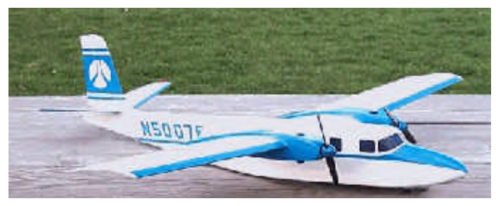
Keith Shaw's Folkerts SK-2 "Miss Detroit"

As far as specs (from memory): Span: 42" Area: 260 sq.in. Weight: 41 oz. Power: two A stro Cobalt 02s, 8 x 900SCR, Astro 215D, MasterAirScrew 5.5/4.5 props @12K, 14 amps."