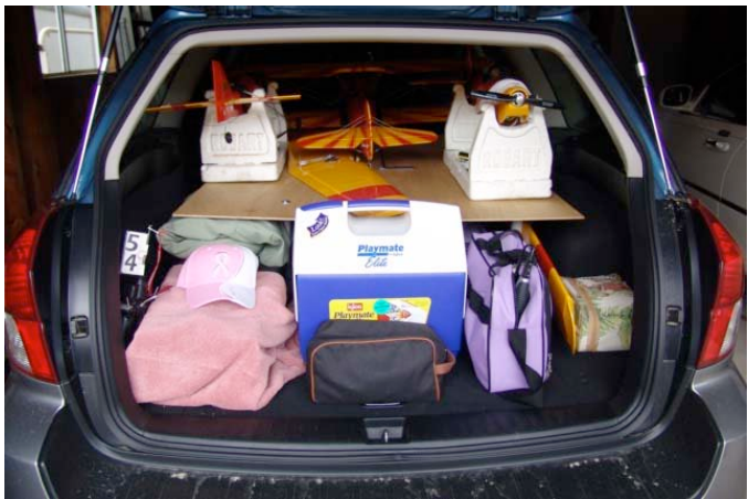
The Subaru outback is loaded with planes and all our gear for the weekend. Chris and I LOVE this event! Note the two-tier storage.

Sunday was very windy. But it was all worth it. It is always a great event with great, great people and planes.