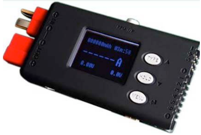
Progressive RC PowerLog 6S

The Power Meter by E-flite is NOT RECOMMENDED. It does not display all of the essential information on one screen.