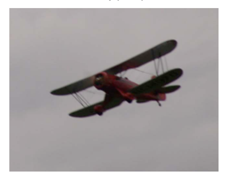
We are already looking forward to the event this year! It should be the weekend of June 4<sup>th</sup> and 5<sup>th</sup>. Watch for the event notice in upcoming Ampeers .