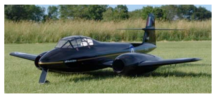
Jim Young's Gloster Meteor Ready for Maiden

We took full advantage of the nice day. With the 2010 Mid-Am fast approaching, many of us took advantage of the nice weather again on the evening of July 2.