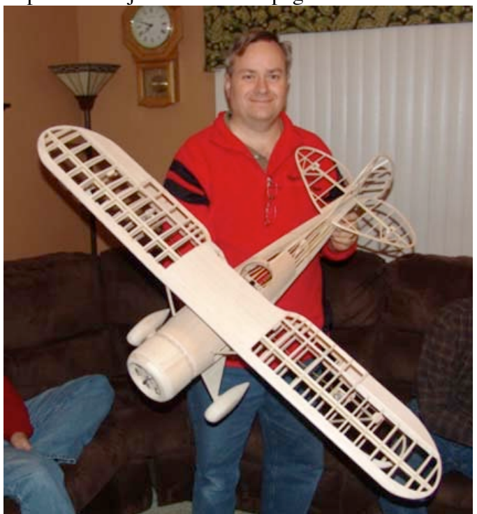
He also brought along plans for a new micro racer to use the AR6400 system from Spektrum. It should be a fun indoor and outdoor flier.

2300mAh pack in this project. The plans and kits for the WACO are available from Jim at http://www.tnjmodels.rchomepage.com/