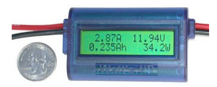
Watt's Up Meter

I high recommend the Hyperion Emeter 2 even though it is quite expensive.