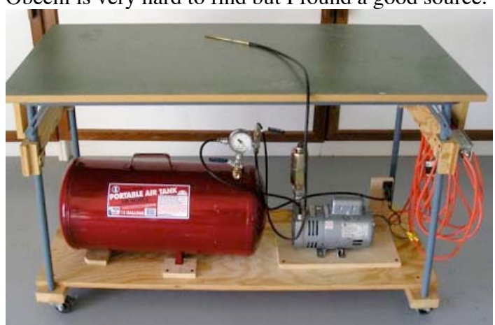
Jim's Vacuum Pump system for composite wing. About $150 in parts.

Attached is a picture of my scaled down Four Star 40. It's been re-engineered so much it doesn't have much in common any more. Even the airfoil was changed to a non -stall S8036/S8037. The wing is Obechi over foam, which is my favorite construction. Obechi is very hard to find but I found a good source.