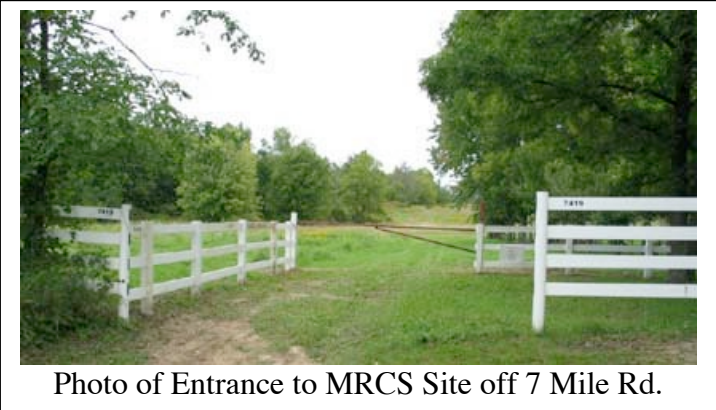
Photo of Entrance to MRCSS Site off 7 Mile Rd.

To locate the Midwest R/C Society 7 Mile Rd. flying field , site of the 2010 Mid -America Electric Flies, look near top left corner, where the star marks the spot, near Seven Mile Road and Currie Rd. The field entrance is on the north side of Seven Mile Road about 1.6 Miles west of Currie Rd. Address: 7419 Seven Mile Road, Salem Twp, MI 48167-9126 - numbers on the fence Mid-America Flies Hotel List – 2010 Please call the hotels for current rates