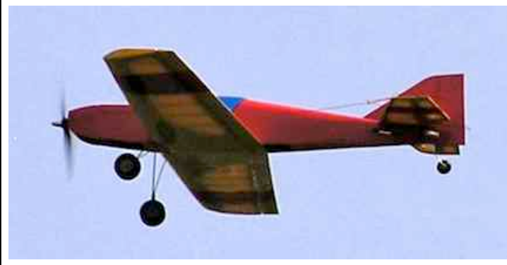
Fusion 380 inflight with 72MHz system

http://www.rcgroups.com/forums/showthread.php?t=990241