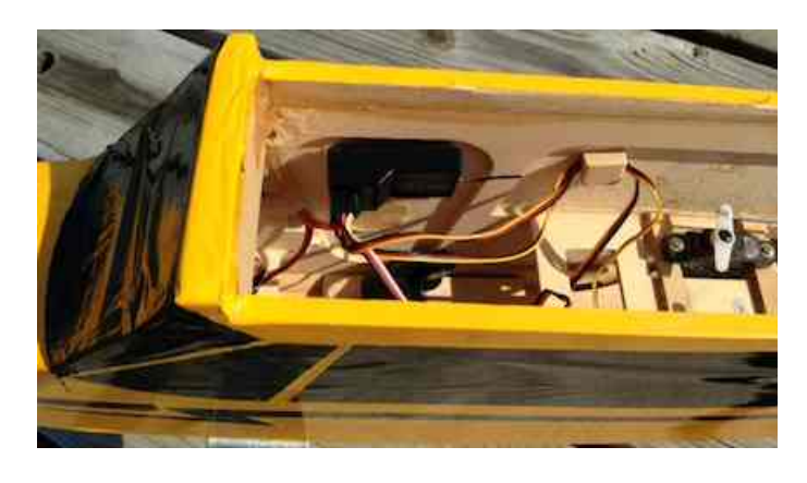
A Tactic TR624 installed in the LzyCub

much easier. A switch harness is not really necessary but handy. A charged 4-cell NiCad or NiMH pack can be plugged directly into any port connector on the receiver, but Tactic does provide a battery port connector on the receiver. That is a very nice touch.