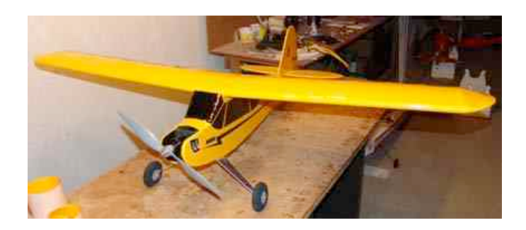
Thunder Tiger Lazy Tiger Cub - club trainer

sq.in. of wing area and its ready to fly weight is 63.5 oz./3.97 lb./1.8Kg.