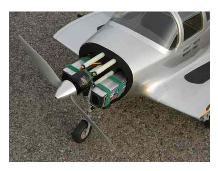
Inside the cowl