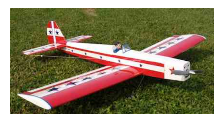
Flite 40 Low-Wing Sport Plane

A second Tactic TR624 receiver was purchased at Flightline Hobby, 1192 S. Lapeer Rd. Lake Orion, MI 48360. It is the very best RC hobby shop in the area and worth the 57 mile round trip!