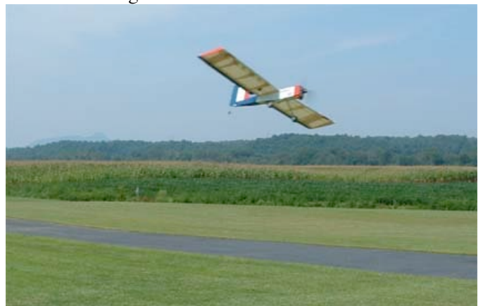
And it flies too!

The model’s size didn’t match his needs, but no problem – he tossed the plan on a copier set for 85% full size and pushed “Start”! Marcus substituted a built-up wood structure for the original foam wing and also converted her from trike to tail-dragger after experiencing too much landing ‘bounciness’.