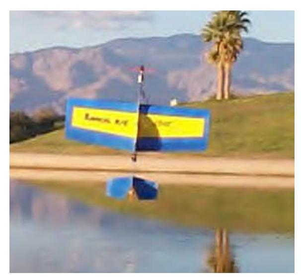
Radical Edge 540 Torque Rolling over Water!

facilities to post a picture which would make the mods so much clearer.