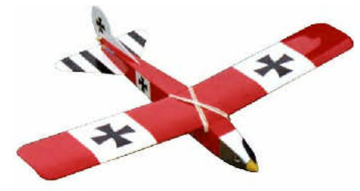
Photo of Fenix 400 from: http://www.komtek.no/fly/S_Models_mainpage.htm