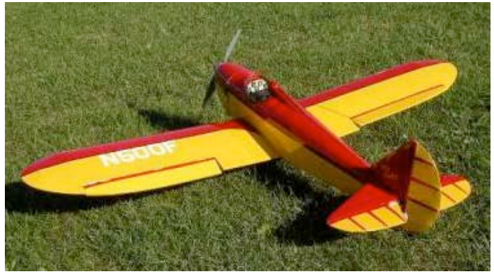
However it does make for a very nice flyer once I got used to its characteristics. It also has a good "cool factor" in the air as well.

First flights proved to be a handful as I had misread the CG location and was experiencing problems with premature ESC cut out. After replacing the faulty ESC and resetting the CG to its proper place, the plane flew much better and had no problem flying at below half throttle It does take some time getting used to a plane like this one as it is a scale model needs to be flown much as the "real" Fly Baby does.