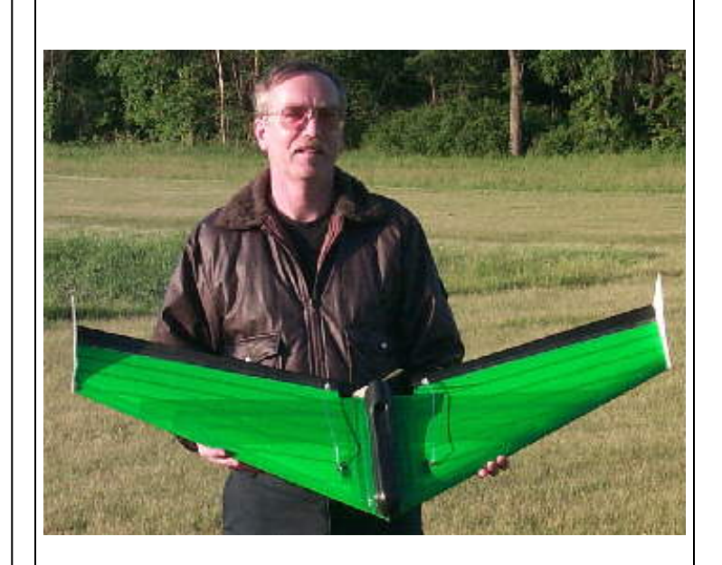
Rest in Peace My Friend

Nov. 6, 2019, Wednesday, 12 p.m.- 2 p.m., indoor flying at the Legacy Center Sports Complex, 9299 Goble Dr, Brighton, MI 48116 (details in this issue)