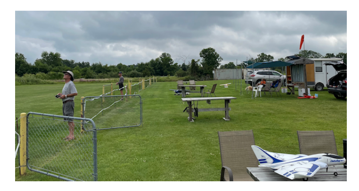
Denny (foreground) and Pete (background) flying on this very grey day The August and September EFO Flying Meetings