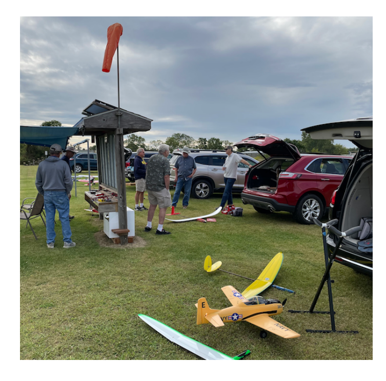
The guys gathered and chatted on the cool morning.