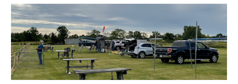
On Saturday, September 4 , 2021 the sky started off a bit dark, but it grew a bit brighter as the day went on. The attendance was quite good. It finally turned out to be a great day for our monthly get together.