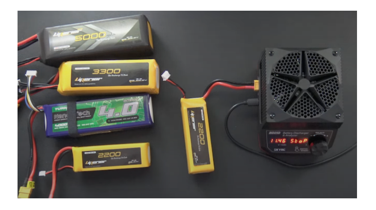
Screen Capture from the Video

I felt that this was a well presented and thought out video using a lot of analytical data. The presenter used the SKYRC BD250 250 Watt 35 Amp Variable Battery Discharger and Analyzer Tester for Hobby Remote Control Vehicles Digital LED Display Continuous Discharge to gather the data.