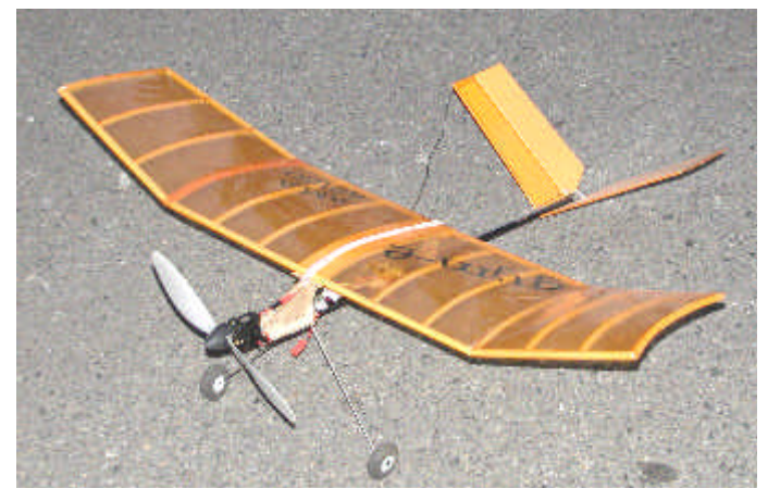
Do you live on a cul-de-sac? (As a matter of fact, I do. KM) If so Todd's Gym-E can use the same stuff that's in your Bantam and you can fly it right in the cul-de-sac. I do with mine. It will be a great indoor plane

The other is a bit heavier and uses the same motor (but a different ratio) as in the GWS Zero and Beaver. It comes with two wing choices (really aerobatic - the "Sport", and really, really aerobatic - the "3D) and has a retractable gear option! This is the Mountain Models Switchback. I have a Switchback Sport with retracts and right now it is my favorite plane of all. This one is 9.9 ounces plus battery - so is flying at 14.6 with 8 cell 720 mAh NiMH packs.