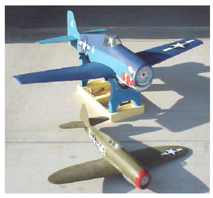
Jeti Powered Hellcat

I have GWS receivers in several small planes (a 6 channel one in the Switchback) and they do pretty well - no adjacent channel problems at all, but watch out for swamping. I've just gotten a Berg that will go in the Switchback for busy flying sites and meets, though.