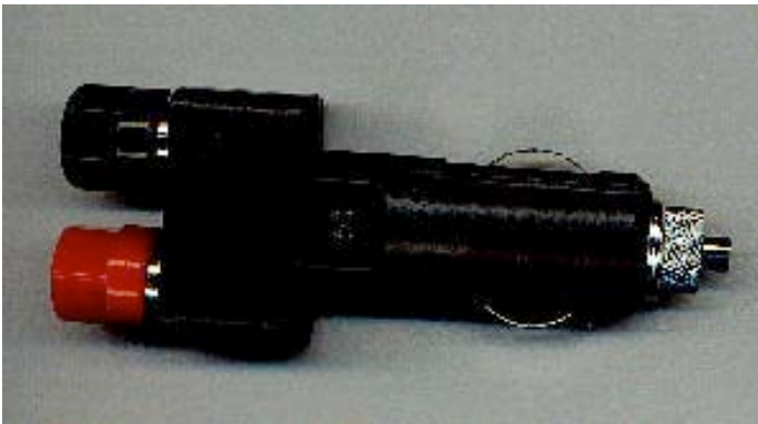
Radio Shack Adapter - #270 - 1521