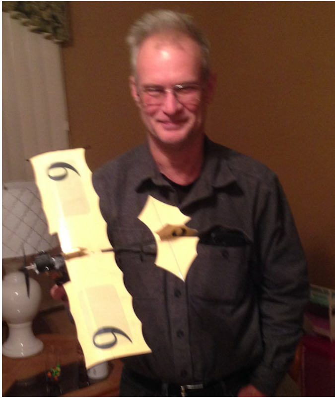
The first was, appropriately, a Pete. Actually it is a RetroRC Howard DGA3 "Pete" foamy.

http://retrorc.us.com/katana-3-2-2-1-1-1.aspx Pete said he's using a Turnigy 1811 2900Kv motor, Thrush 6A ESC and 3 3-gram servos. He noted that it flies "okay".