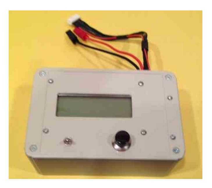
Volrath BattIR Meter

The article also contains many other useful links for learning about LiPo batteries and the value of knowing their internal resistance.