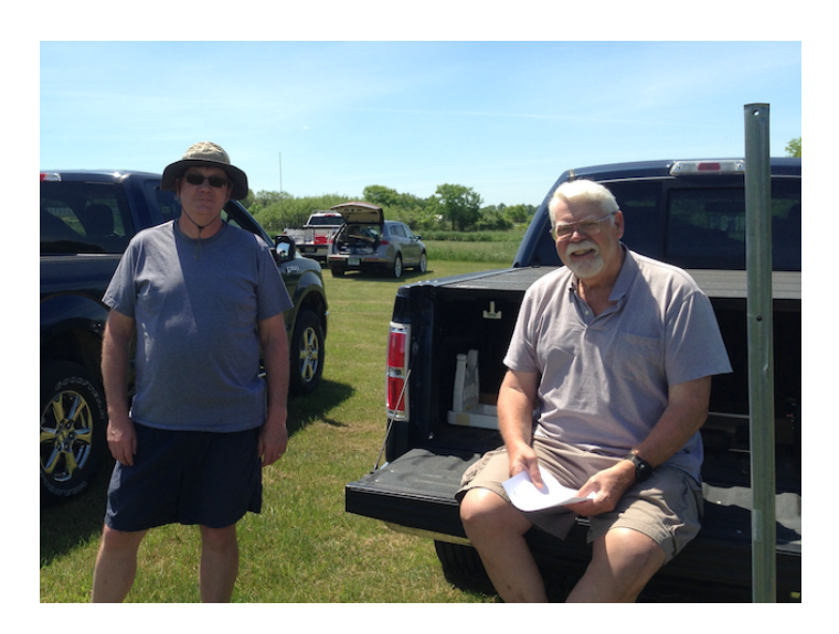
The February 2020 EFO Meeting

Even with the interesting winds, it was a great day at the flying field for our first time out together this year.