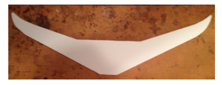
The wing planform cut out of foam board

I created a piece of foam board that the entire physical wing would fit onto. I measured and weighed that piece of foam board. My original piece was 24" by 10" for 240 sq.in. of surface area. It weighed 44.4 grams.