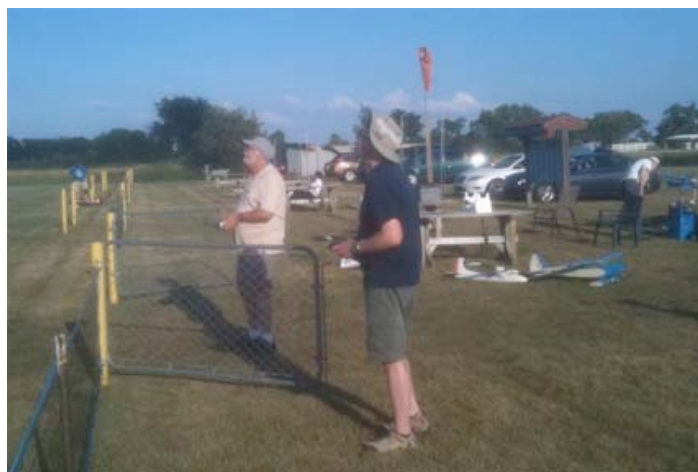
The Midwest July flying meeting was held on a very hot July 6th.