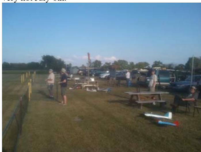
A good number of pilots turned out and made a lot of flights on this hot evening.

The next flying meeting is scheduled for August 3, weather permitting. Always be sure to check your email and the club Web site for the latest updates on the scheduled meeting.