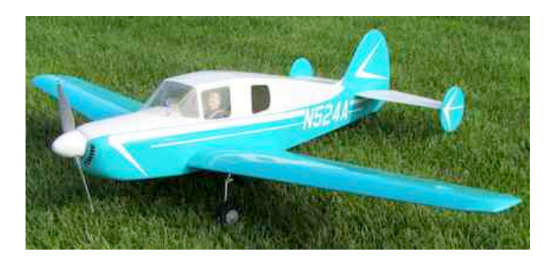
Denny Sumner's Bellanca Cruisemaster