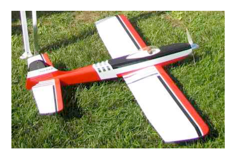
Denny Sumner's New Era III