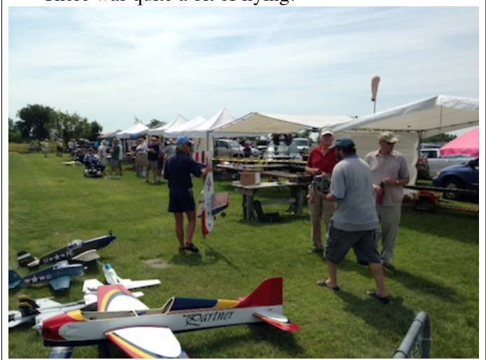
Full Mid-Am Report at http://www.theampeer.org