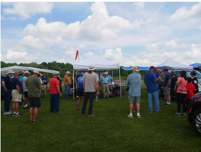
Everyone Sings Happy Birthday