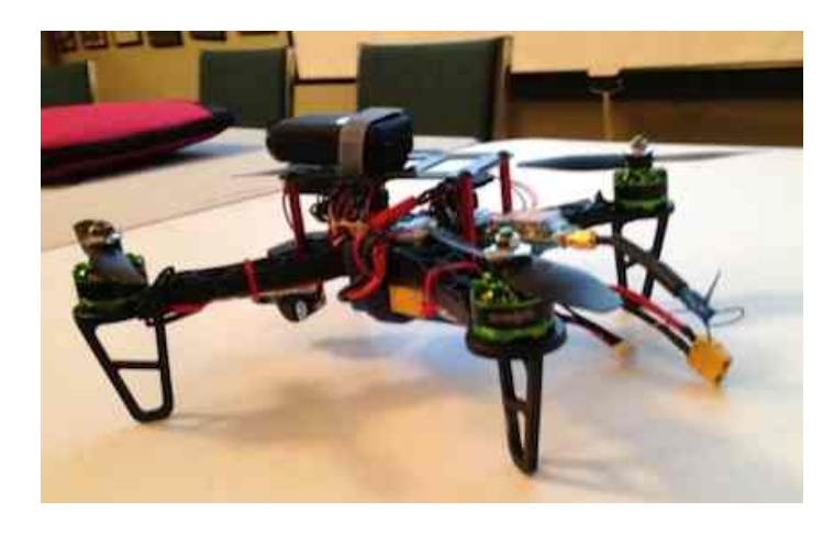
Larry's Racing Quad

http://www.meetup.com/FPV-Tree-Racing-League-Chicago/about/