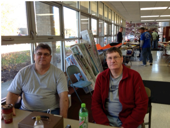
Manning the door and concession stand

There was a very good turn out of Midwest member to helps, vendors to sell and attendees. The preliminary results look quite good.