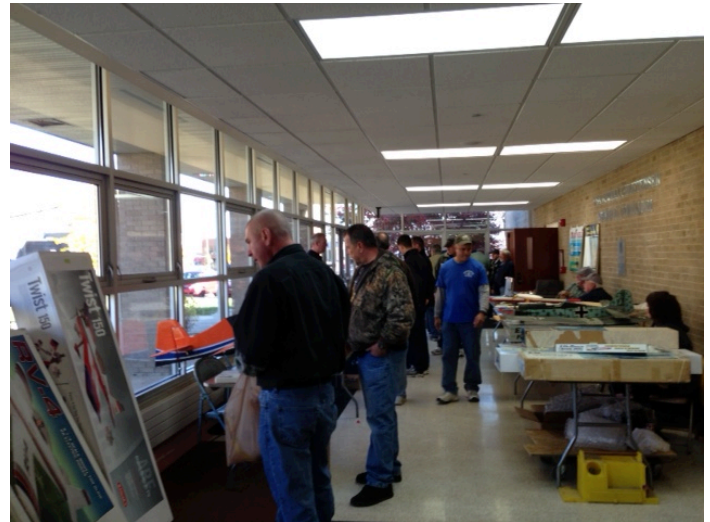
A Look Down the Entry Hall Inside the Main Hall