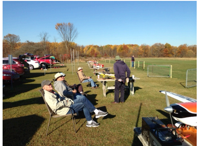
A Beautiful Fall day at the Flying Field

Overall, the fall of 2015 did not present too many nice flying days, November 2nd, 3rd and 4th were beautiful and in the 70s.