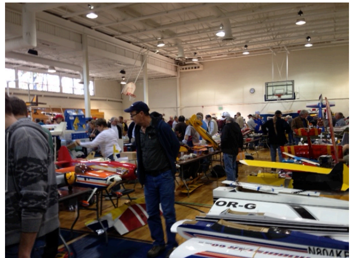
Fall Field Photos