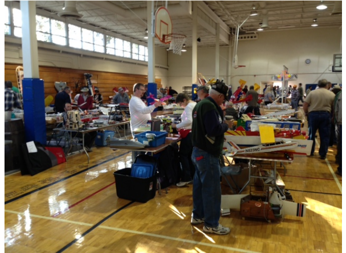
The November 2016 Swap Shop

Dec. 7, Wednesday , No Video this month, 7:30 p.m. MRCS social meeting with desserts & 'white elephant' gift exchange, short business meeting