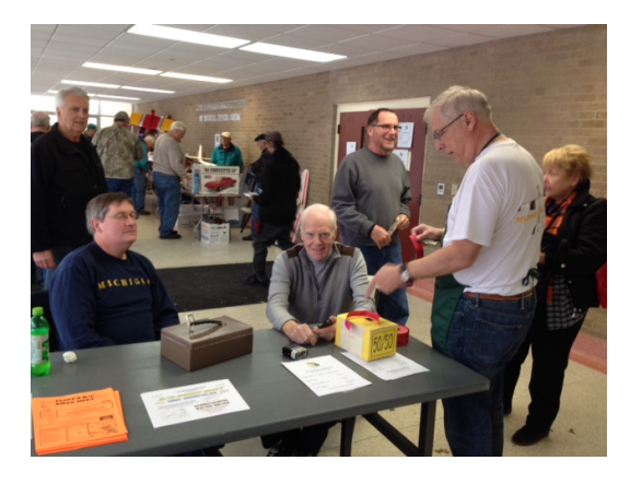
Collecting the Entrance Fees

Helicopter Frequencies 21,27,29,39,41 Sailplane Frequencies 11,12