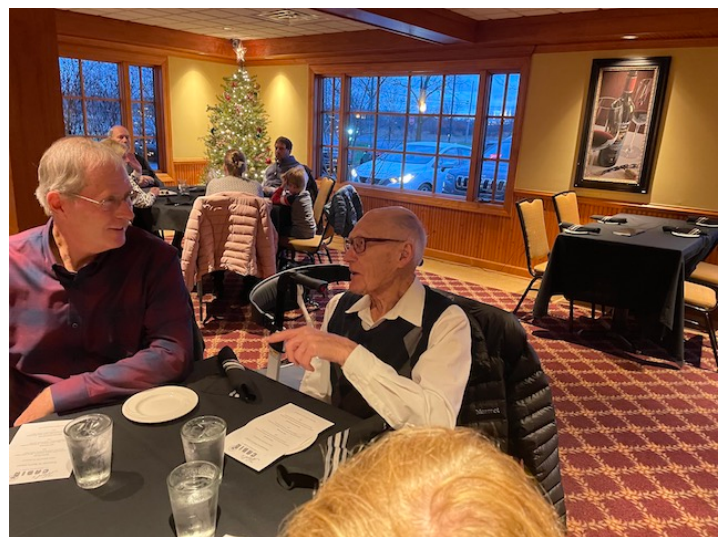
Mr. "Life of the Party" with his son