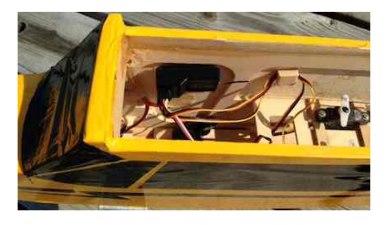
A Tactic TR624 installed in the LzyCub

harness is not really necessary but handy. A charged 4-cell NiCad or NiMH pack can be plugged directly into any port connector on the receiver, but Tactic does provide a battery port connector on the receiver. That is a very nice touch.