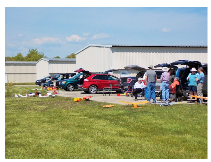
The Airport Setup.

The Midwest RC Society & EFO Fly at the Plymouth-Canton Mettetal Airport