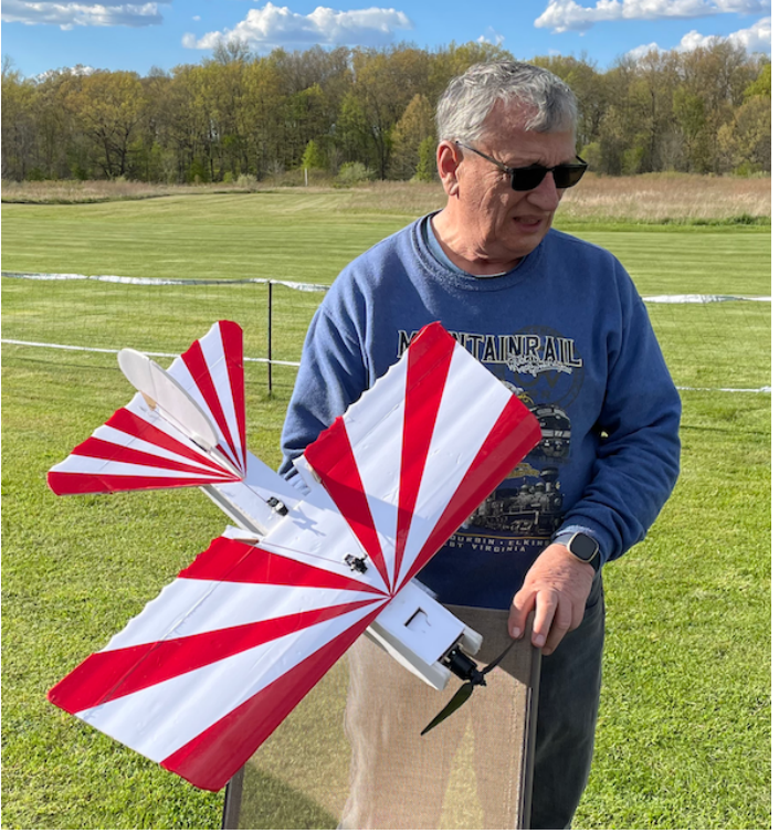
UFO members ordered and built them. He says that it flies great.

He noted that he built it for the United Flying Organization (UFO) combat events. He noted that 15