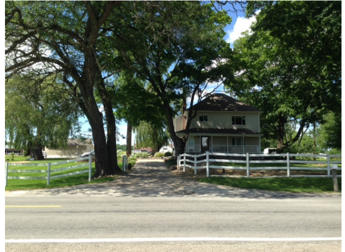
This is what the flying field entrance looks like. Please Drive SAFELY

The old entrance to the Midwest RC Society flying field is permanently closed!!! DO NOT ATTEMPT TO USE IT!!!