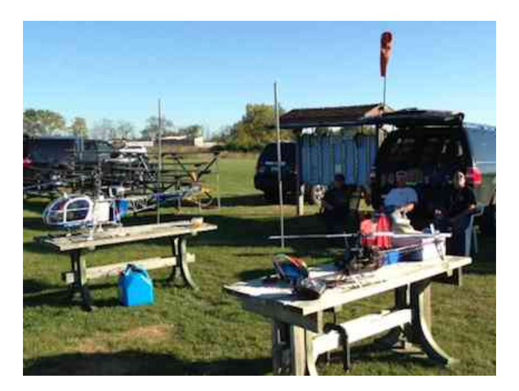
Relaxing in the shade before another helicopter flight.

All kinds of flying craft from trainers through turbine powered helicopters took to the skies.