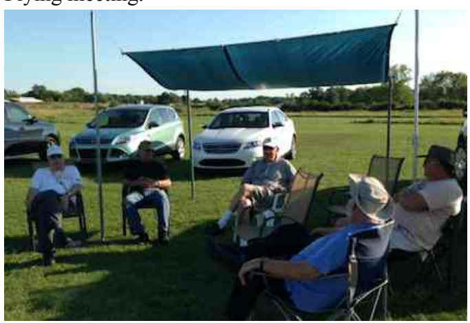
Our Swap Shop is close at hand. Please volunteer your time!

Some of the members relaxing at the September Flying meeting.