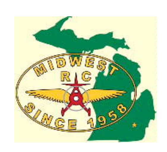
The Midwest RC Society

Nov. 6, Sunday , Midwest RC Swap Shop (details in this issue)