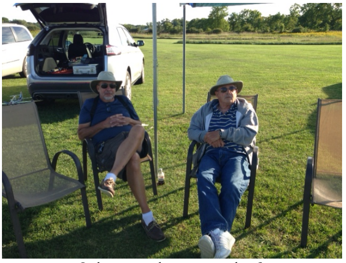
Is there to much pressure out here?

The September meeting was postponed from September 7 to the 14th because of rain on the 7th.