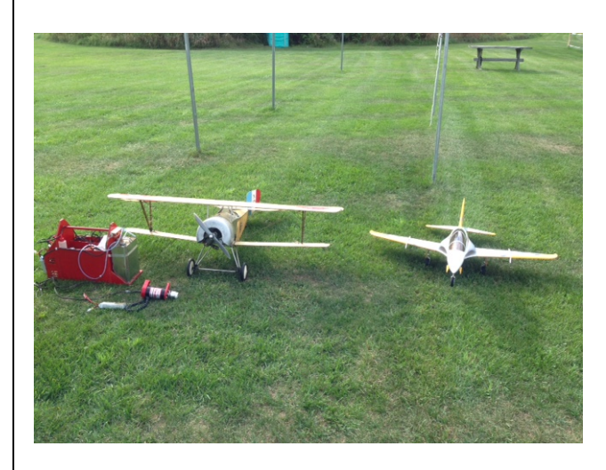
A couple of Bill Brown Jr.'s cool planes!

Please join us for our October flying meeting. Note the 5 p.m. start time do to darkness falling much earlier now.