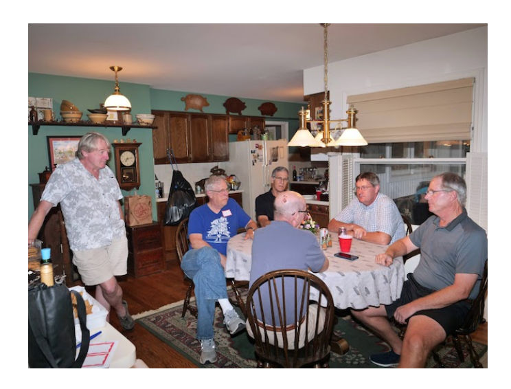
Hope you enjoy the pictures.

From Rick: Pictures of this fun filled and great conservation event are shown in the attached.