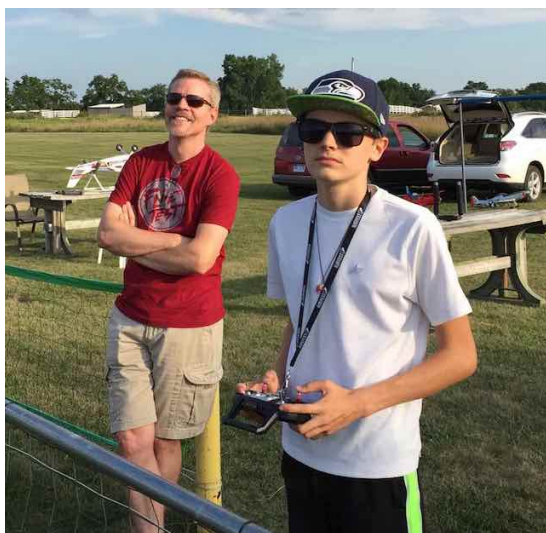
AJ enjoys the evening

Six brave pilots "braved" the elements for the postponed August meeting. Conditions were near perfect, slight crosswind from the south but a good time was had by all.