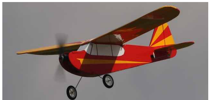
Ken Myers' , Award Winning, highly modified, plans built, Flite Test Simple Cub