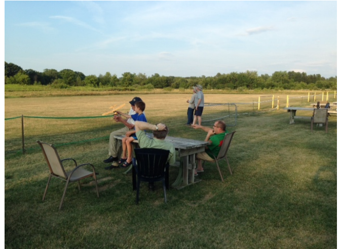
It was ground school and then flying.

The attendance was good and there was a lot of flying.