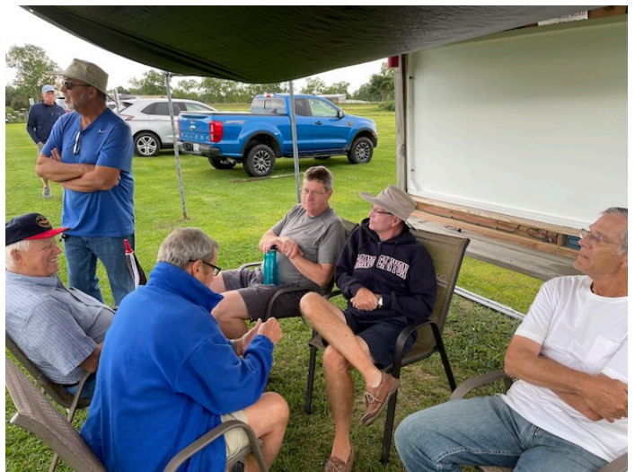
An hour and a half before the scouts arrived, the members were huddled under our sunshade and wondering if this evening's activities would even come off.