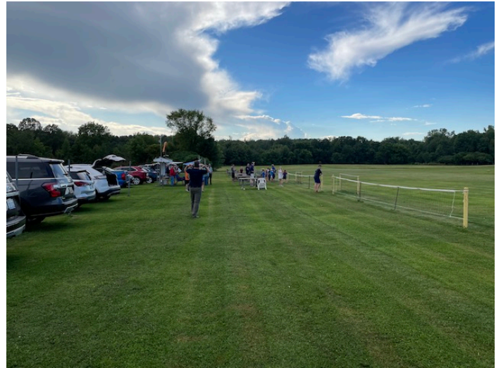
The cars show the amount of folks at the field and the weather is seen clearing.