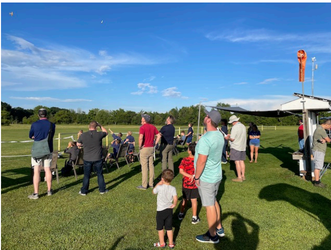
The spectators enjoyed the T-28 Pylon Race.