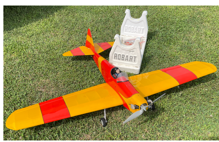
Ken's Son of Swallow Out for Its First Outing in over 5 years - It flew Great!!!